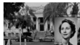
Albertson Public Library Orlando, Florida

In 1929 the Library was designated as the State Depository for the Florida Chapters of the Daughters of the American Revolution.